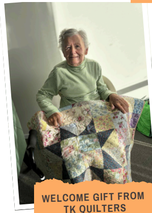
WELCOME GIFT FROM TK QUILTERS