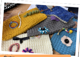
GIFTS FROM VOLUNTEERS HEATHER & CHRISSY