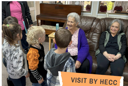
VISIT BY HECC KIDS