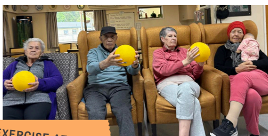
EXERCISE AT KAURI