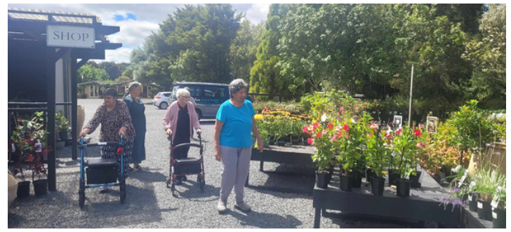
Ladies' Day Out at Wairere Gardens

Aside from these, we have daily activities like baking, art projects, monthly Bunnings workshop, Men's Group Outing, and regular van rides. These activities are designed to improve physical and mental health, and promote independence and social engagement, ultimately contributing to a higher quality of life.