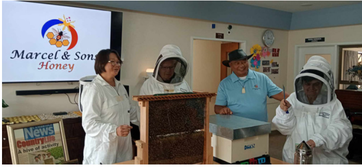
Workshop on Bees by Marcel & Sons