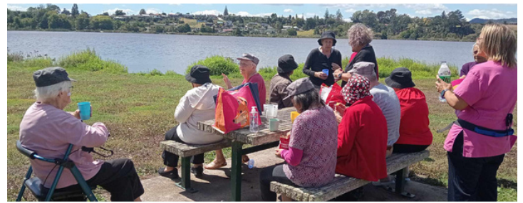
Afternoon Outing at Lake Hakanoa