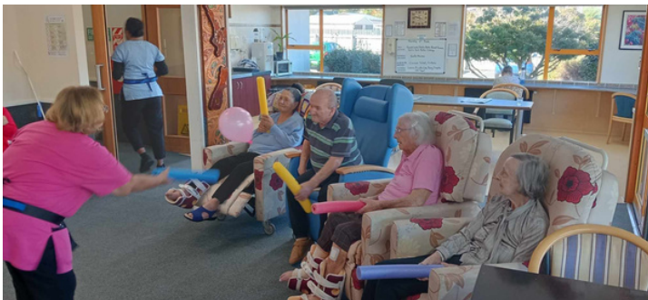
Daily Exercise and Games at Hospital