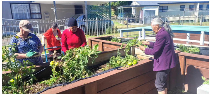
Gardening and Enjoying the Sun