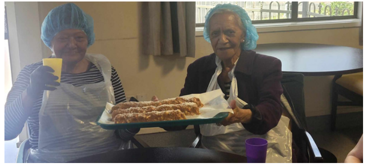
Cooking and Baking in Kauri Wing