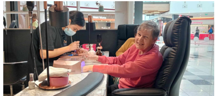
Ladies' Day Out - Shopping

For the coming months, our Diversional Therapist team is planning to increase the number of activities in both the Rest Home and Hospital wings to improve the chances of residents to become fit in all aspects - physical, mental, emotional, spiritual and social.