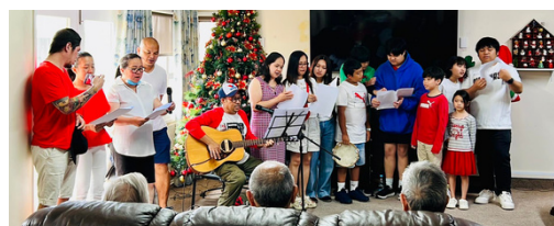
Filipino Families in Huntly

The holiday season is over and our residents had a wonderful time because of the individuals, groups, whanau and friends who came to visit and made the holidays extra special.