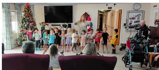
Huntly Early Childhood Center