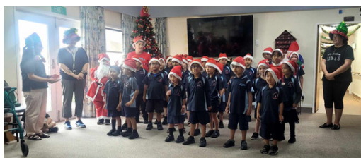
St. Anthony Catholic School